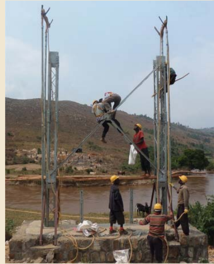
Tower erection, top; interaction with beneficiaries, second; walk way placement, second from bottom; suspension bridge over the Ruvubu River, bottom.

Once built, the bridge changed lives. Villagers came to dance and sing on the bridge. For a while, they continued to be bullied into using the boats but things changed. They grew in confidence and some even started taunting those who had exploited them since times immemorial, "Hey boatman take your boat and use it as firewood. We are no longer victims of your monopoly and misconduct," they sang.