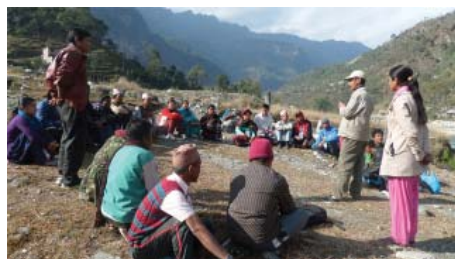
Bridge site selection, top; a truss bridge constructed in Indonesia, second; suspended bridge in Nizogi, Burundi, second from bottom; public audit after bridge completion in Nepal, bottom.