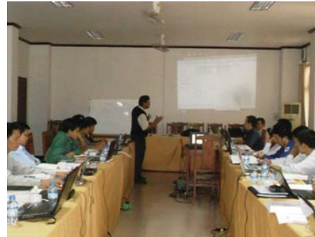
Trail bridge design training for government employed engineers in Laos, top; a new suspended bridge in Ethiopia serves as an example, second; bottom two photos, bridges improve market access.

Collaboration with Burundi was initiated in 2010. An exploratory visit by Nepali experts took place that year. Subsequently, in 2011, HELVETAS Swiss Intercooperation Nepal experts conducted a fea-