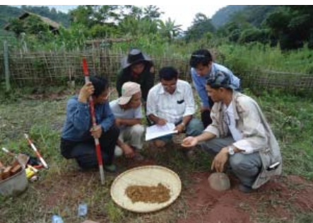
Rudimentary cane bridge over Mongo River, Cameroon, top; bridge site survey and soil identification process in Laos, second from bottom.