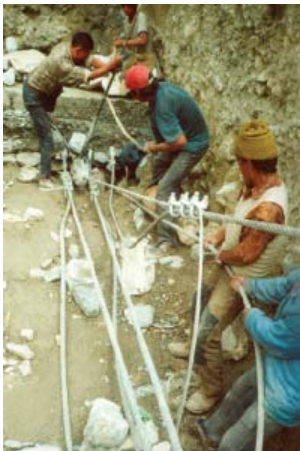
Suspension bridge construction training by Nepalese technician to Burundian technicians, top; cable pulling in Nepal, bottom.

sibility study and designed some bridges at the request of the Burundian Government. In 2014, HELVETAS Swiss Intercooperation successfully completed the construction of seven bridges in Burundi: two steel truss, two suspended, and three suspension. The Burundi Project had been launched through a tripartite agreement between the Road Department of the Government of Burundi, African Development Bank, and HELVETAS Swiss Intercooperation. A team of seven experts from Nepal were deployed to implement the project. User committees were engaged in construction to enhance their know-how of bridge building and maintenance. Fabricated steel parts and wire ropes were not available in/around Burundi and thus were transported from Nepal and India. Design training for Burundian engineers is expected to take place in 2015 in Nepal. There appears to be an enormous need for trail bridges in Burundi. An exploratory trip has been planned for the winter of 2015.