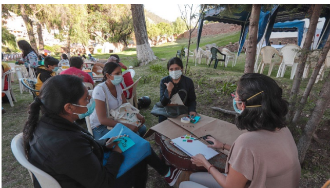
Groups of citizens develop ideas for the development of the city of Sucre.

In Bolivia 70% of the population is settled in urban areas, mainly consolidated by rural migration generating a spontaneous and horizontal urban growth. The demographic pressure, socio-economic shocks and climatic dynamics have led to increasing socio-spatial inequalities, mainly for vulnerable populations living in informal and risky settlements. The project contributes to an increased level of resilience of the city of Sucre (urban space and surrounding areas) and improves citizens' welfare in the peripheral neighborhoods. It reduces the negative effects of urban growth based on participatory planning, and the development of a municipal integrated urban agenda. HELVETAS implements other complementary urban projects in Sucre with focus on youth entrepreneurs, waste management and sanitation, in addition to resilient cities.