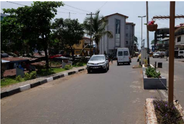
Flower pots, improved greening and new benches in front of the new City Hall.

There are many points of potential exchange between the two cities. Both can learn from each other's approaches and practices. So far, exchanges have focused on participatory practices in urban regeneration with both cities providing inputs on how they do this in different scenarios.