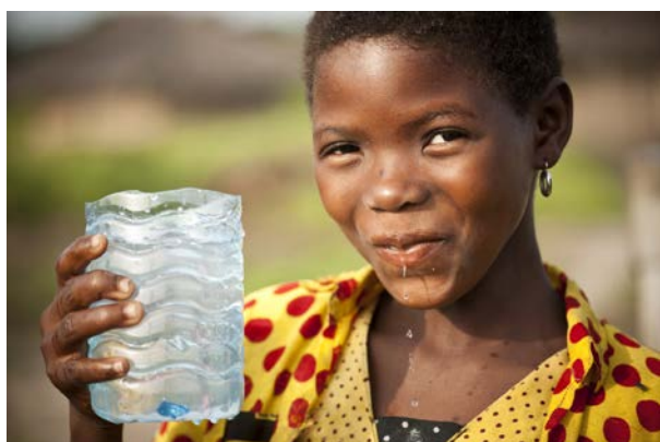
Safe drinking water from the new build well.

According to Mozambique's water policy, municipal authorities are to cooperate with local water commissions and private companies to ensure that the water supply functions more reliably and is expanded. In the remote north of the country, however, there is little experience available and a strengthening of the actors is necessary.