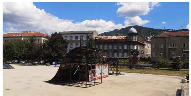
Public space in the city of Sarajevo.

Today, despite mechanisms for public participation evident in legislative frameworks, processes are not transparent and possibilities to participate in such procedures are limited. With the support of this project, Sarajevo will improve its urban planning and management capacities based on reliable data, good quality analysis and multi-stakeholder engagement.