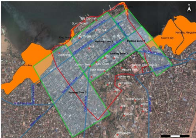
CBD showing regeneration zones Graphic: SLURC (Sierra Leone Urban Research Centre)