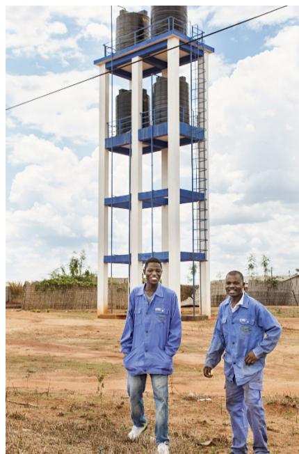
Water towers ensure a secure water supply in small towns.

measures by the trained authorities, companies, craftsmen and water commissions.